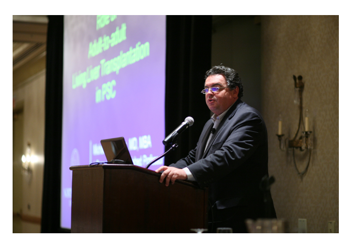
Dr. Michael Abecassis

The problem is that cholestatic diseases like PSC and PBC are the worst diseases to have in terms of the MELD score because the score is determined by the bilirubin level which is one of the least weighted values in the logarithmic calculation that is the MELD score.